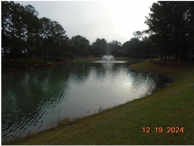
Pond 5: Pond was in fair to good condition. The water level is normal. Treated for spatterdock by boat.