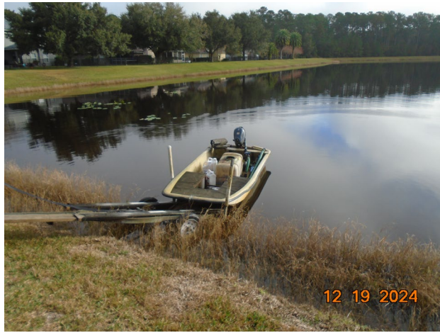
Pond 11: Pond was in good condition. The water level is normal