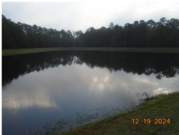
Pond 12: Pond was in very good condition. The water level is normal.